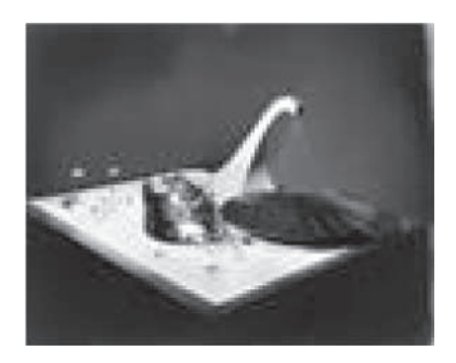
Figure 1 Model of Australian pavilion at Expo '70, Osaka.

pavilion and designing the exhibition area in which the majority of the displays would be presented. Dubbed the 'space tube', this area sat to the side and beneath the main body of the pavilion. Conceived as a narrow, sloping tunnel, its interior took the form of 'an immersive and partial multimedia environment'.<sup>27</sup> Twin moving walkways carried pavilion visitors past Boyd's carefully organised narrative of Australian progress, preventing them from steering their own path through the exhibit or lingering over particular displays.